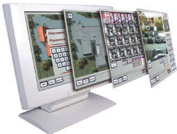
Perimeter Security Manager for complete perimeter control.

MicroPoint Cable's major components are the Processor Module, MicroPoint™ cable and Windows® software. The Processor Module provides the system intelligence to perform powerful signal processing, DC power distribution and data communications networking. The MicroPoint cable permits easy connection of the perimeter system and provides DC power, data communication for alarms and control, and intrusion detection capabilities. Site Manager software provides site design, installation, and service capabilities.