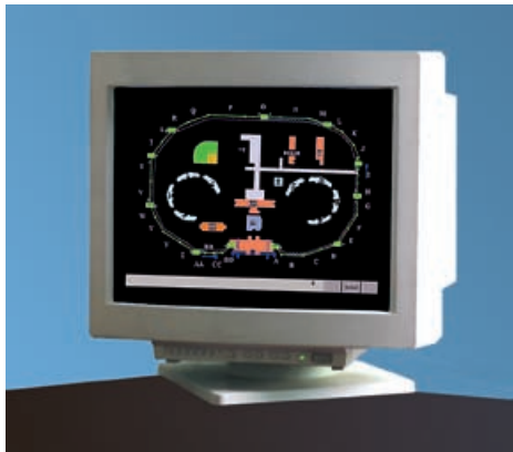
INTREPID™ Map Monitor for precise intrusion location and alarm reporting.